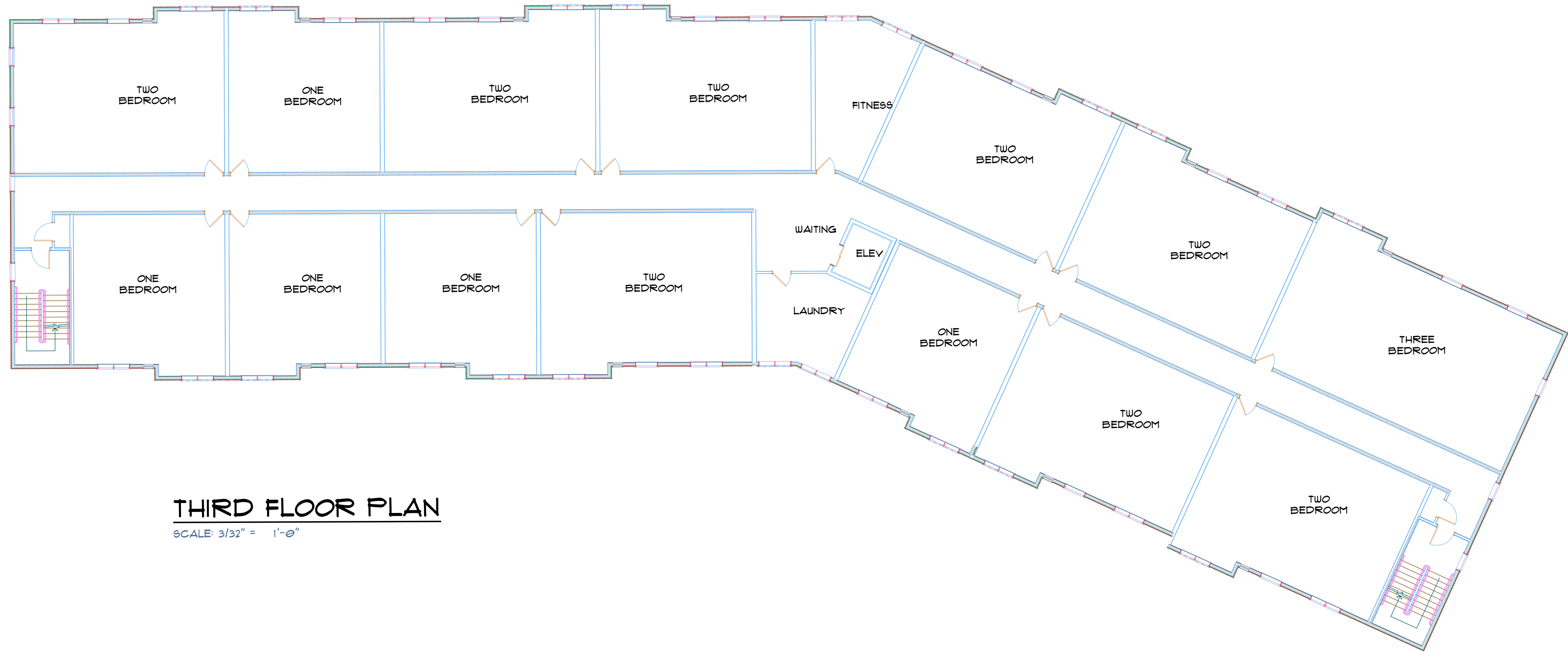
THIRD FLOOR PLAN SCALE: 3/32" = 1'-0"